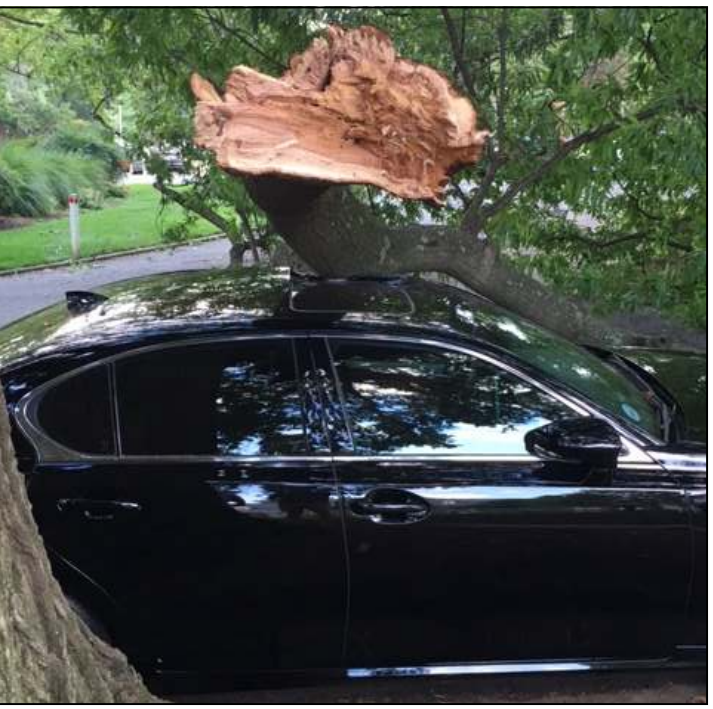
The noise of the crash got the attention of several neighbors. The limb caused severe damage to this Lexus, which the owner had leased just three months ago.