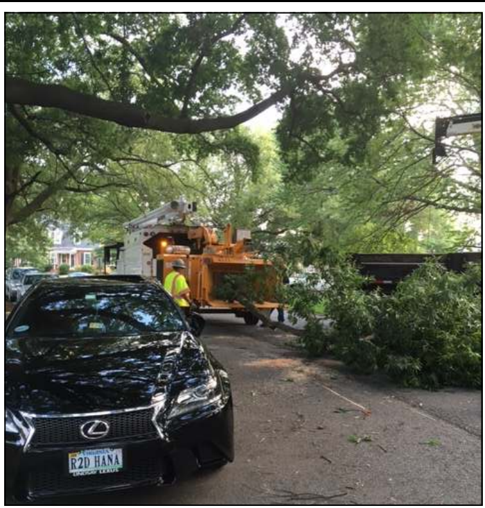
Arlington County clean up crews sent most of the broken limb into the chipper.