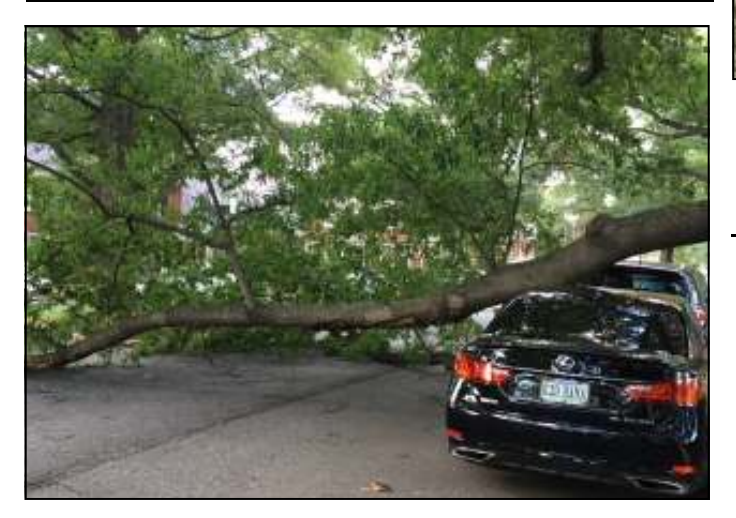
The limb, estimated by to weigh 2,000 pounds, blocked traffic at the Stafford Street Circle for more than an hour.