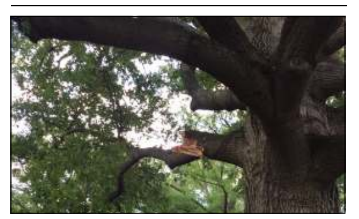
The limb literally snapped free from the tree. Thankfully, nobody was injured.