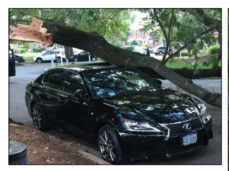
On the afternoon of August 30, a large tree limb from one of our mighty street trees crashed down onto this parked car.