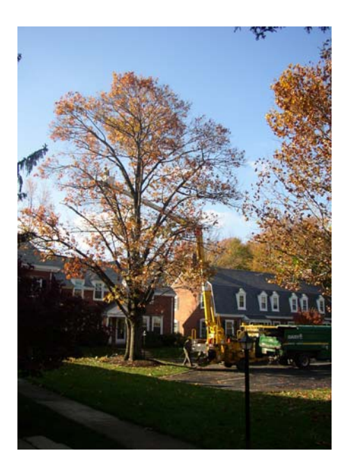
Ct 1 Red Oak Trimming Work