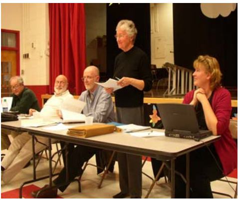
Numbers are Us!