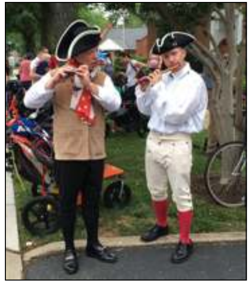
Two fifes/no drum - but wonderful patriotic tunes.

One of the many great Fairlington traditions is the annual July 4th parade that starts at the fire station on S. Abingdon Street and heads just up the street to the Fairlington Villages Community Center. In the community center parking lot following the parade, the crowd gathered for free ice cream and hots dogs, plus there were Fairlington t-shirts and baked goods for sale.