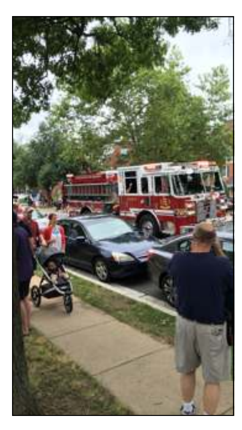
Arlington County Fire Department's Engine 107 brings up the rear of the parade.