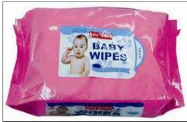
Just because the package says flushable, do NOT flush these or adult wet wipes in Fairlington Glen!

And please be sure to share this important news with your entire family, your guests, and babysitters.