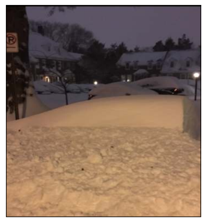
Yes, that's a car under all that snow! This car was plowed in and snow covered while parked on S. Stafford Street.