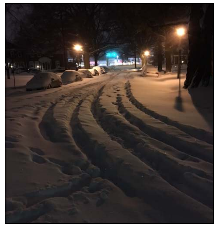
Tire tracks and footprints in the snow on S. Taylor Street with the Bradlee Shopping Center in the background.