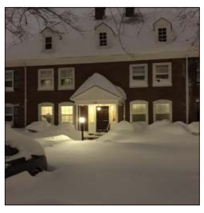
A picture that could have been taken in any court in Fairlington. This one from Court 12 just after the snow stopped.