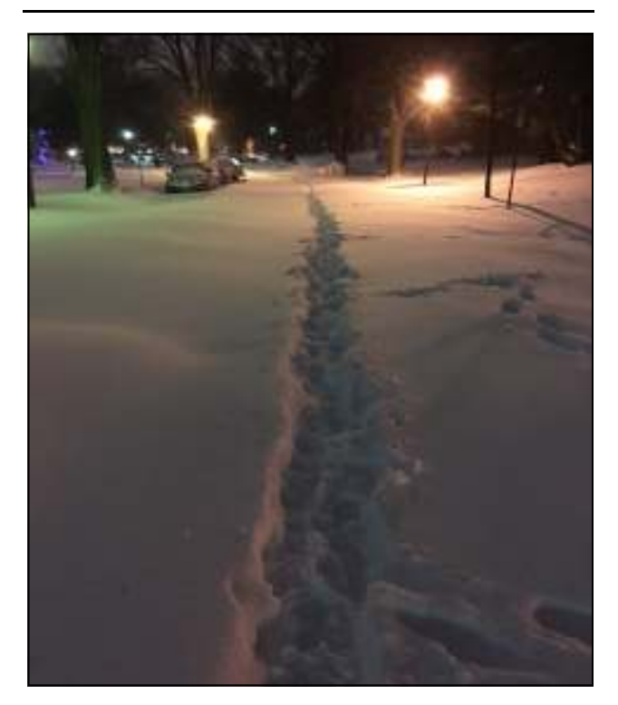
Looking down S. 36th Street from the intersection with S. Taylor Street when only walkers traveled this road.