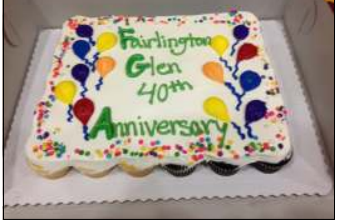
A delicious cake was served at the 2015 Annual Meeting to celebrate the Glen's 40th anniversary.