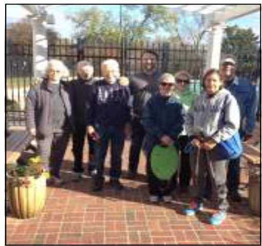
Glen volunteers meet just before going to work on another Fall Clean Up Day.

On Saturday, November 14 a group of Glen residents helped to beautify our community during our Fall Clean Up Day.