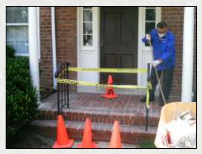
Nelson is seen repairing some of the mortar on the front stoop of 4317 S. 36th Street (Court 10).