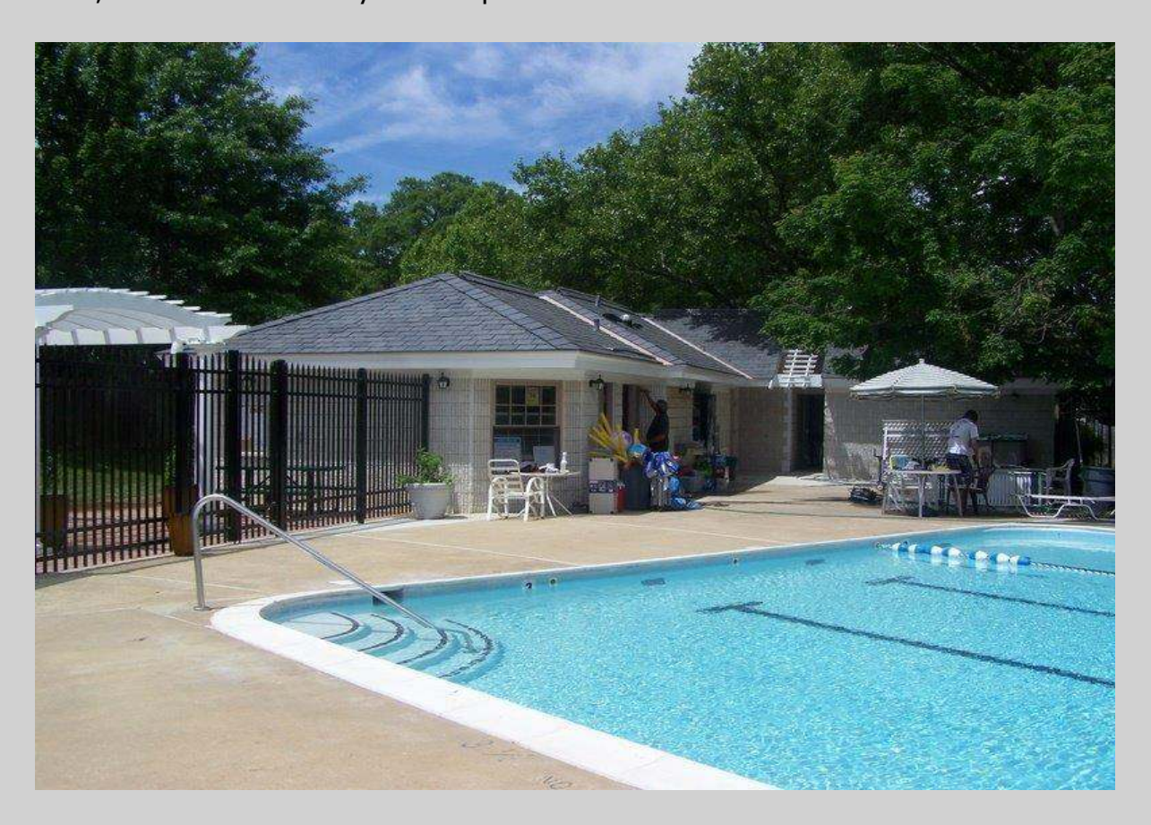
After a long, cold winter, soon it will be time to open the gates to the Fairlington Glen pool for the summer season. Check next month's Glen Echo for more details on the upcoming pool season.